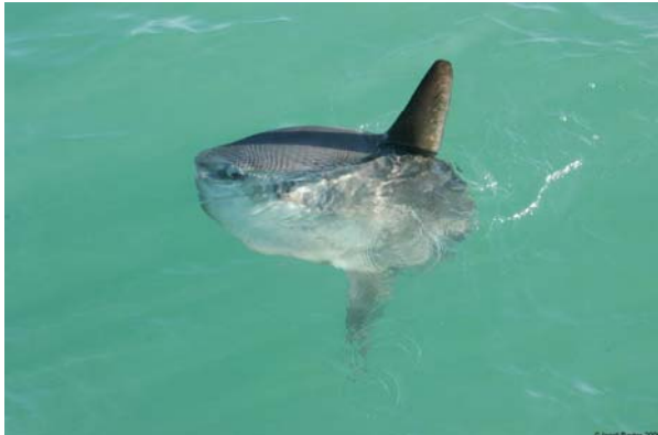
Figure 2: Sunfish

You may think that Welsh waters are cold and dark and not that exciting but nothing could be further from the truth. Welsh waters are cold but we have a fantastic array of marine wildlife in our waters. The area of sea around Wales equals the land area, so this gives you an idea of how vast our seas are. Back in 1992 the UK joined many other countries around the world at a conference in a bid to help our natural resources. As a result of this conference Europe decided to protect our wildlife and our habitats. To do this a network of sites have been established all over Europe and these are called Special Areas of Conservation (SAC). An SAC is designated if it has a good representation of a habitat or species that represents that area. Pen Llŷn a'r Sarnau SAC has twelve including bottlenose dolphins, otters, grey seals, sea caves, reefs and estuaries. The site begins in Morfa Nefyn on North Pen Llŷn and ends at the Afon Clarach near Aberystwyth. So the waters around Bardsey Island fall within the SAC. The two main habitats found at Bardsey are reefs and sea caves. Sea caves are full of animals that have