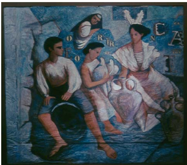
Fig : The Doves by Brenda Chamberlain

Of the many visitors to Bardsey, those who have called in or stayed at Carreg will have viewed work by someone who belonged to a remarkable generation of artists and writers in Wales. Brenda Chamberlain possessed a combination of talents as both painter and writer of poetry and prose.